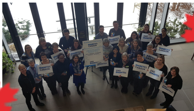
Diabetes Canada celebrates their rebrand with the Langs Diabetes Education Program staff