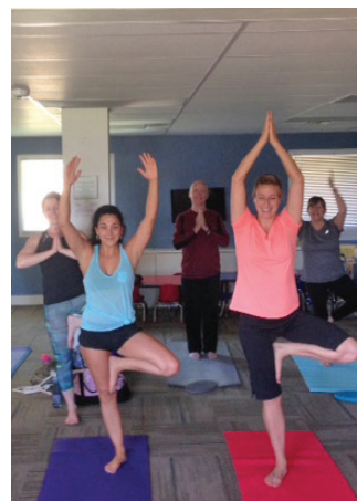
Grow yoga participants