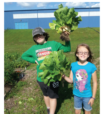
Participants of the Garden Growers program in North Dumfries hold the fruits...or vegetables, of their labour