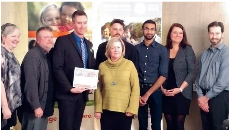
United Way Achievement Award