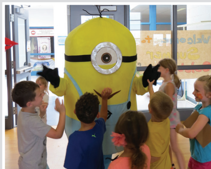
North Dumfries Picnic