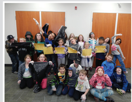
Afterschool Program completed a 'Community Clean-up' thanks to TD Friends of the Environment