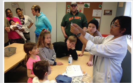
Participants at Grow's Family Fun Night