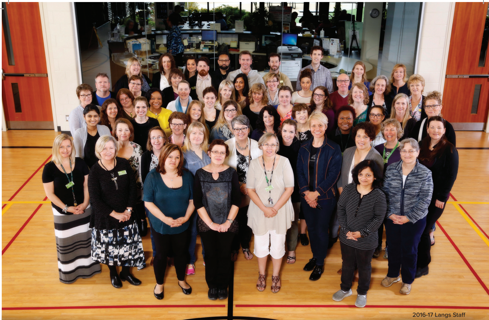
2016-17 Langs Staff