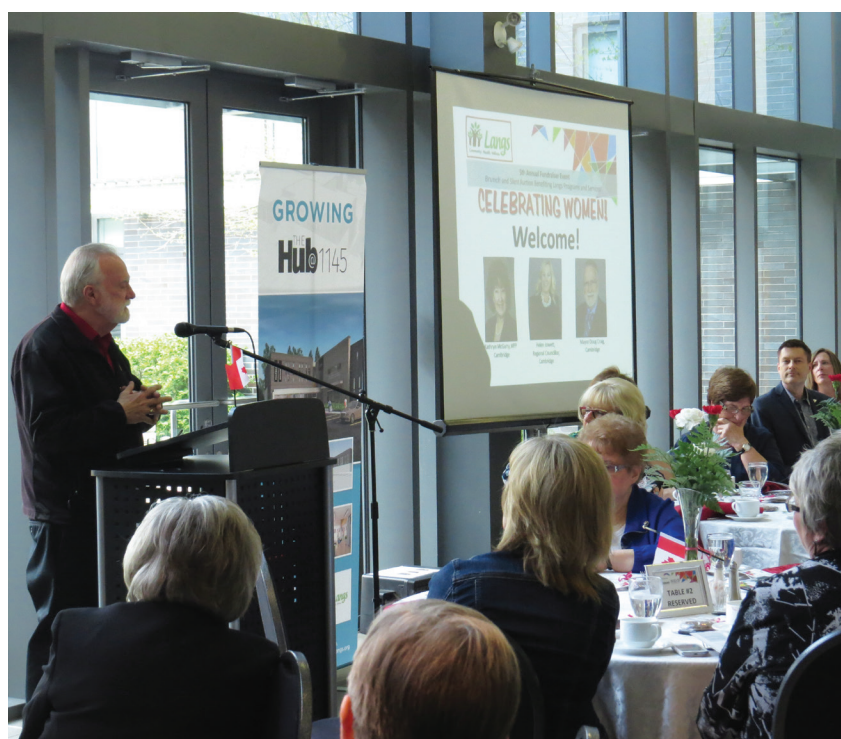
Mayor Doug Craig addresses attendees at the 5th annual Celebrating Women Event