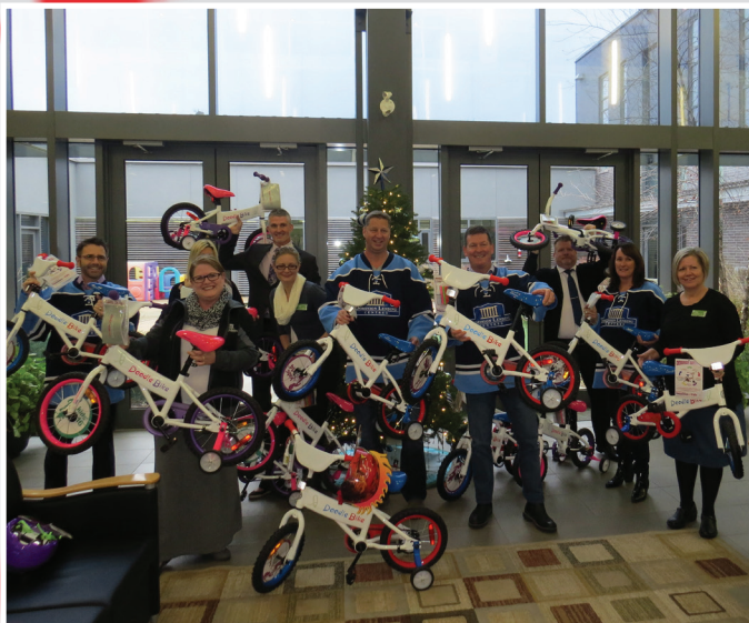
Dominion Lending Centres donated 15 bikes for kids