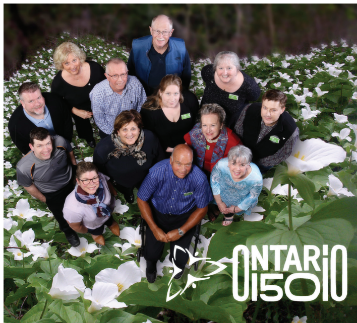
TRILLIUM PHOTO, COURTESY OF ARC OF APPALACHIA