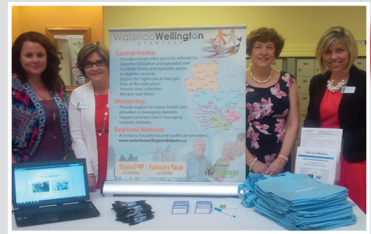
RCC Staff are all set for visitors