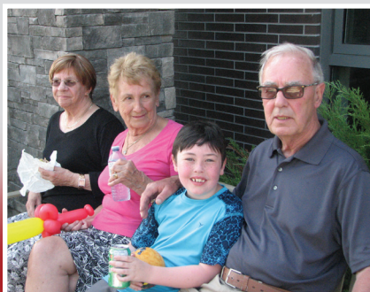
Friends at the Langs Picnic