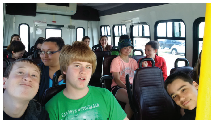
North Dumfries Teen outing to Skyzone