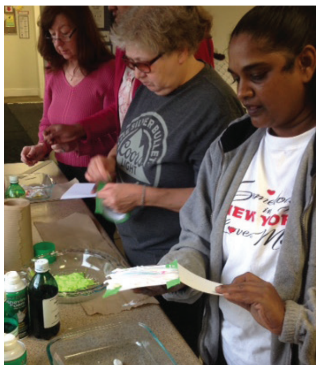
Take a Break participants at Grow

Accumulated surplus at end of year (excluding Capital Fund and Reserves) $4,098