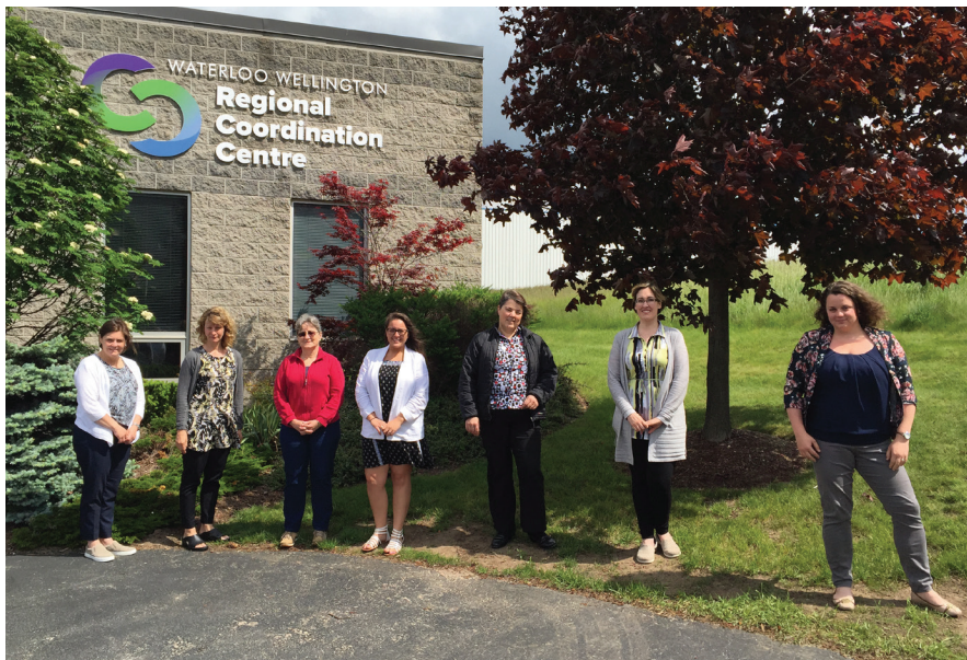
Regional Coordination Centre staff outside their new location