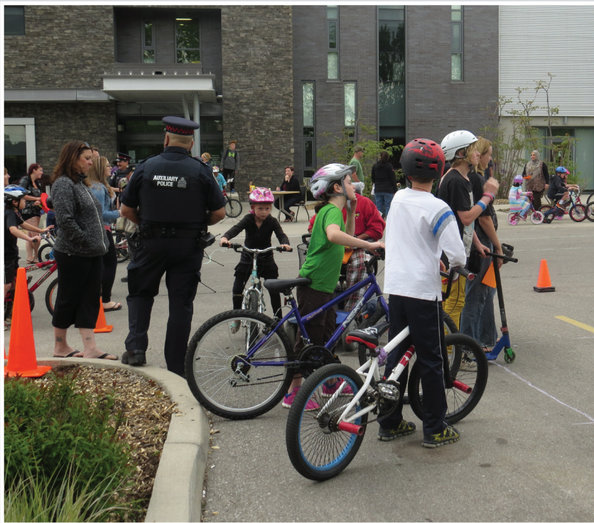
Langs bike Rodeo was a big success