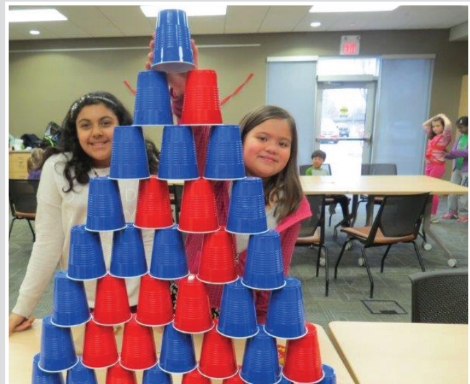
After School Program at Langs